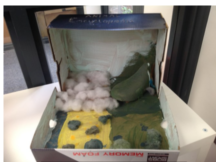
Phoebe in Year 4