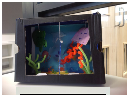
Minnie in Reception

Well done to the following children for winning a book prize in our World Book Week competition. We were very impressed with their creativity and their shoeboxes are now on display in the school entrance for you all to see next time you visit the school.