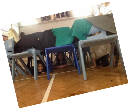
Den building: working as a team. Who can build the biggest den?

Leo's Den is very lucky in the fact that we are able to use all of the schools amenities so when the children are unable to be outside they had free choice to play in the hall or stay in Leo's Den.